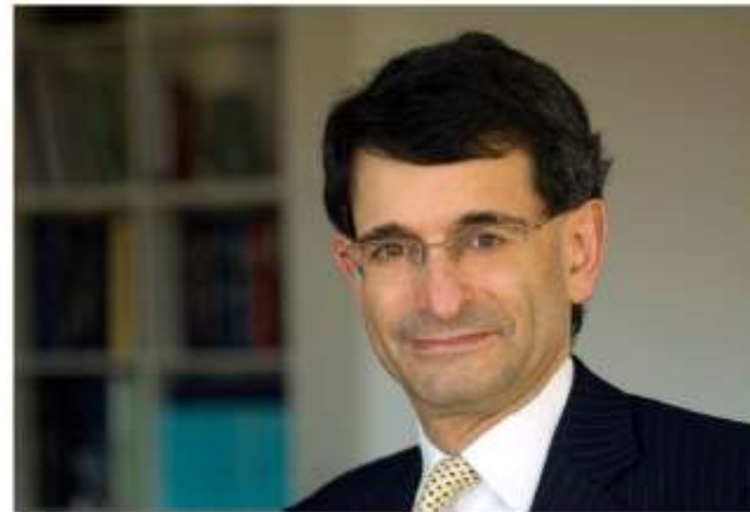
Peter Moores Professor of Management Studies