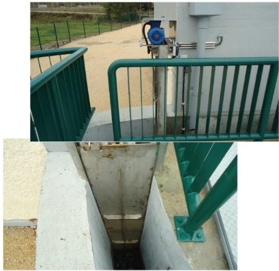
FISHWAY EXIT GATE AND ENGINE