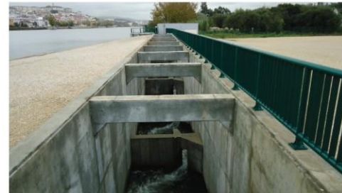
UPSTREAM VIEW OF THE FISHWAY