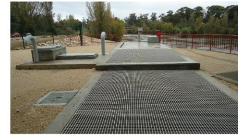
DOWNSTREAM VIEW OF THE FISHWAY AND ADDITIONAL FLOW STRUCTURE