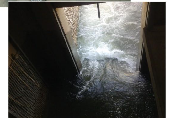
FISHWAY ENTRANCE INSIDE VIEW