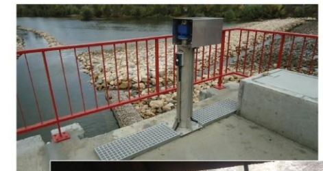
FISHWAY ENTRANCE ENGINE GATE