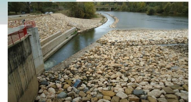
FISHWAY ENTRANCE UPSTREAM-DOWNSTREAM VIEW